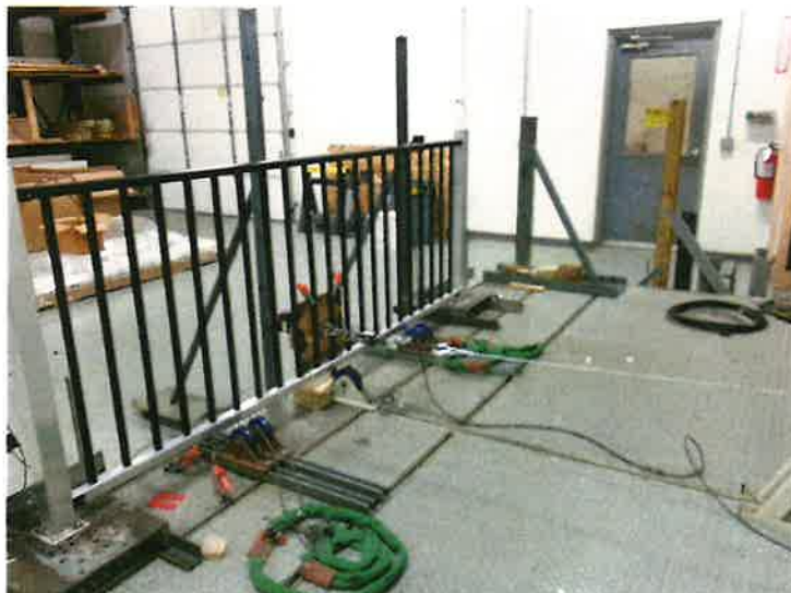
Photo No. 2 In-Fill Load Test at Bottom of Two Pickets