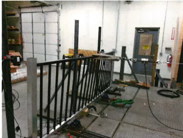
Photo No. 3 Concentrated Load Test at Midspan of Top Rail (Horizontal)