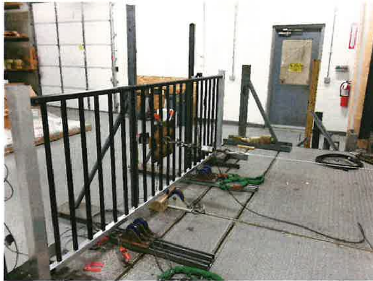
Photo No. 1 In-Fill Load Test at Center of Two Pickets