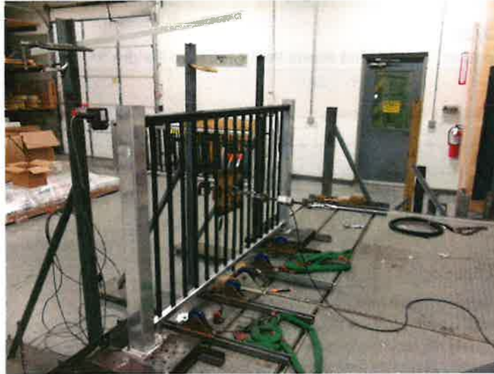
Photo No. 1 In-Fill Load Test at Center of Two Pickets