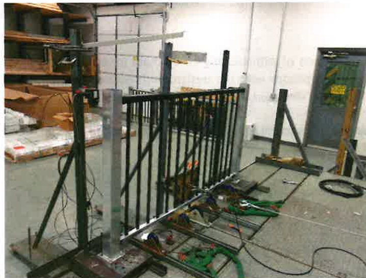
Photo No. 2 In-Fill Load Test at Bottom of Two Pickets