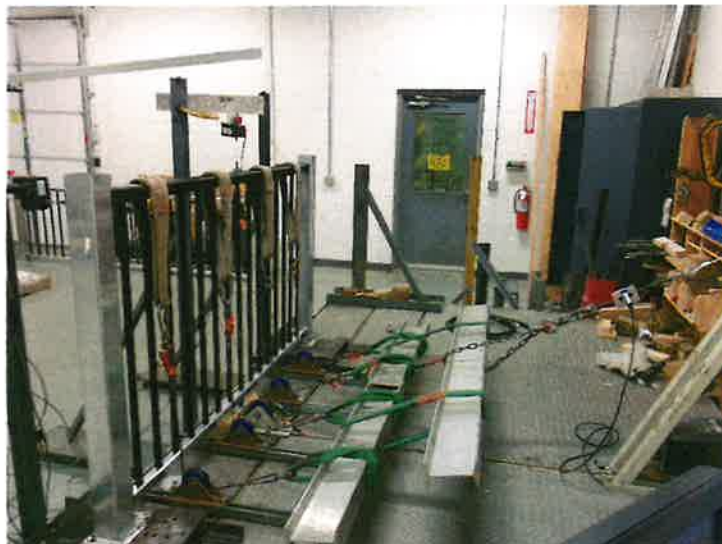
Photo No. 4 Vertical Uniform Load Test on Top Rail