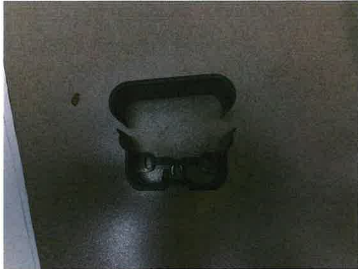
Photo No. 11 Cast Aluminum Bracket for Top Rail