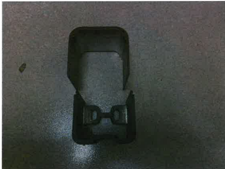
Photo No. 12 Cast Aluminum Bracket for Bottom Rail