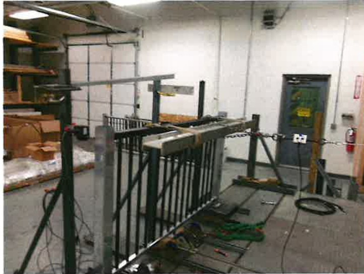
Photo No. 3 Horizontal Uniform Load Test on Top Rail