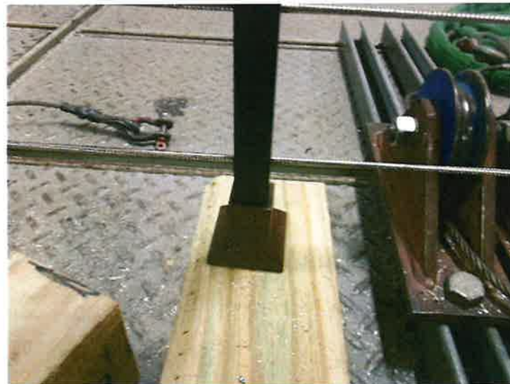
Photo No. 12 Support Baluster to Floor