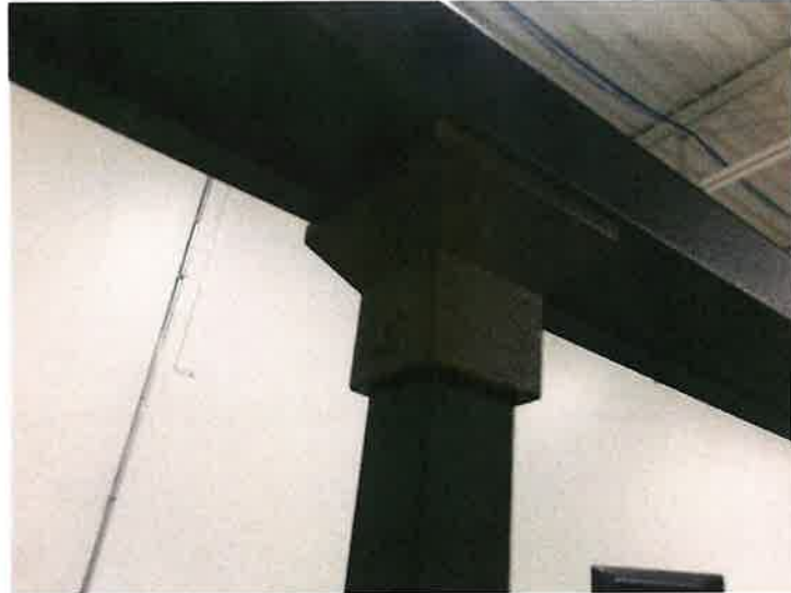
Photo No. 11 Support Baluster insert into Top Rail