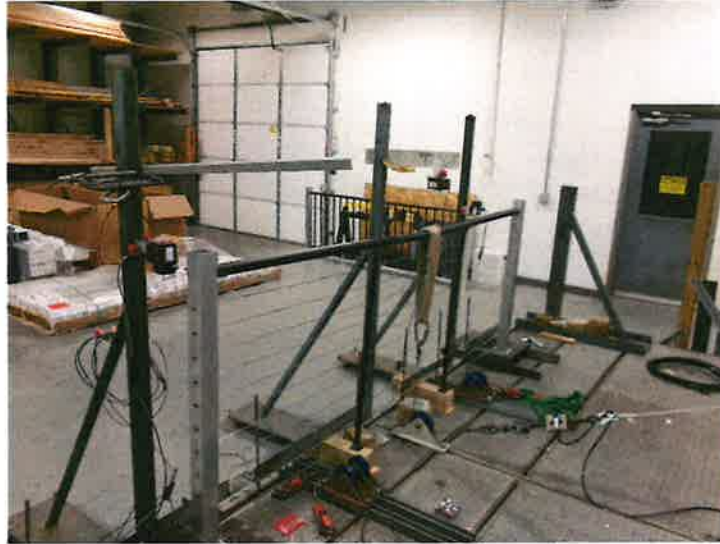
Photo No. 7 Vertical Concentrated Load Test at Midspan of Top Rail