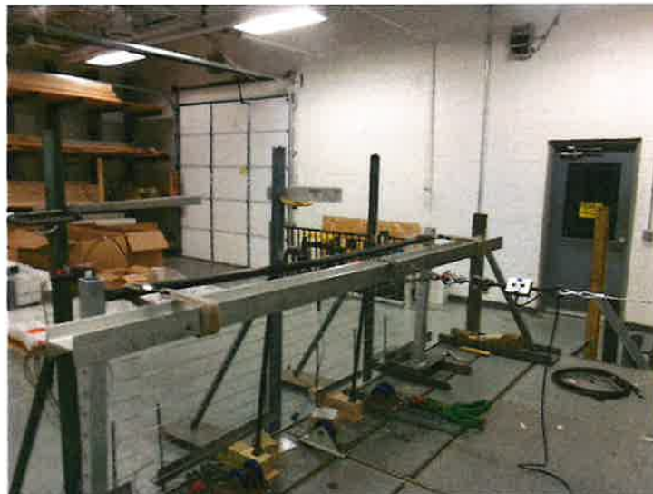
Photo No. 8 Concentrated Load Test at Ends of Top Rail (Brackets) (Horizontal)